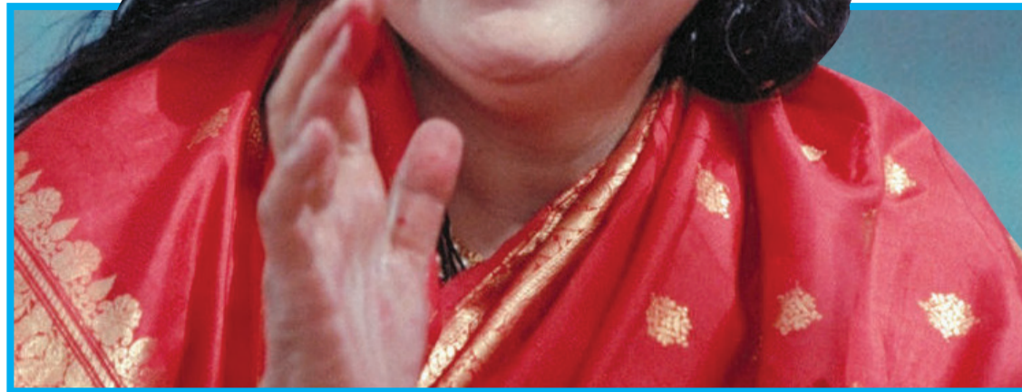
HER HOLINESS SHRI MATAJI NIRMALA DEVI Founder of Sahaja Yoga Giving Self-Realisation by Kundalini Awakening