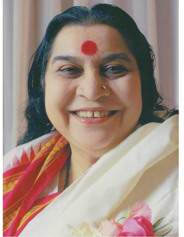
"You have to become Rama from inside"