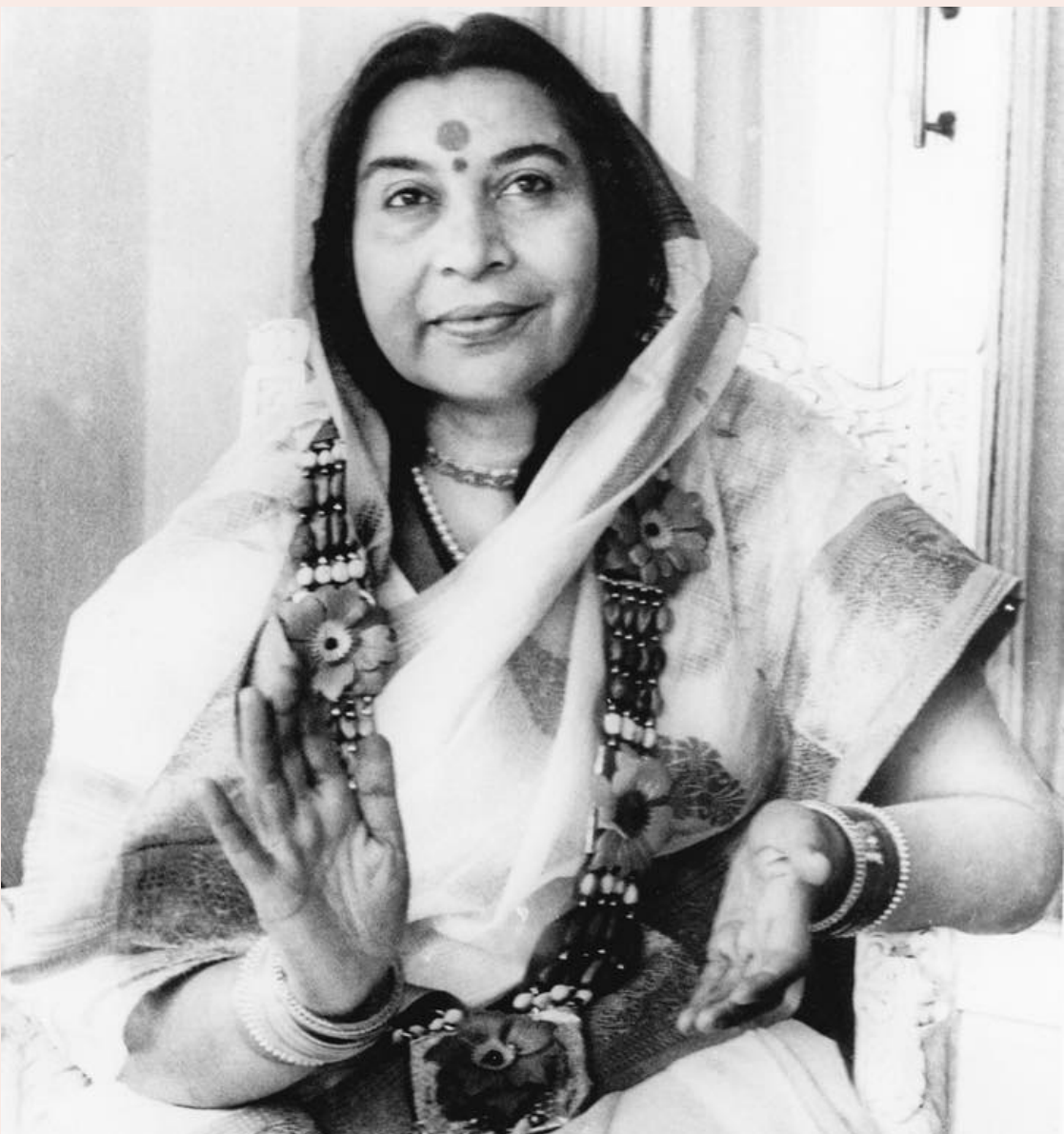
H.H Shri Mataji Nirmala Devi (Founder of Sahaja Yoga)

"The only way one can really understand what we are is by knowing yourself."